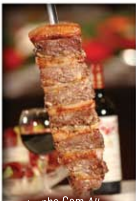
Picanha Com Alho - Rumproast Cut with Garlic