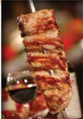
Costelinha De Porco - Pork Ribs