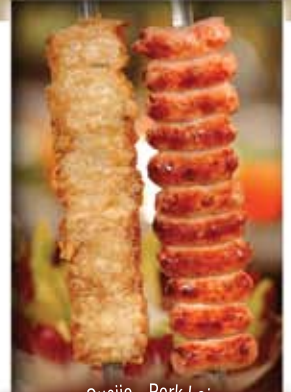
Lombinho Com Queijo - Pork Loin with Parmesan and Salsichao - Pork Sausage