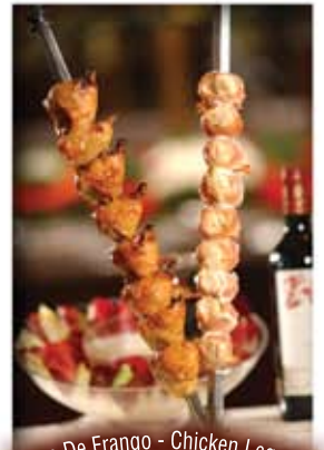
Coxa De Frango - Chicken Leg and Peito De Frango Com Bacon - Chicken Breast with Bacon