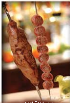
Filet Mignon - Beef Tenderloin and Filet Com Bacon - Beef Tenderloin with Bacon