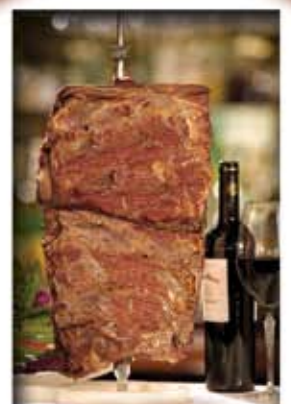
Costela - Beef Ribs