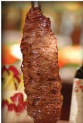
Fraldinha - Bottom Sirloin