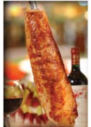
Lombinho - Pork Loin