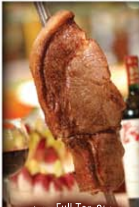
Alcatra - Full Top Sirloin